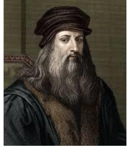
Leonardo da Vinci