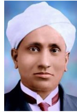
C V Raman - Indian Physicist