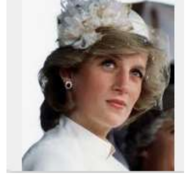
Diana Spencer – Princess of Wales