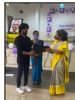
AO giving away the mementos