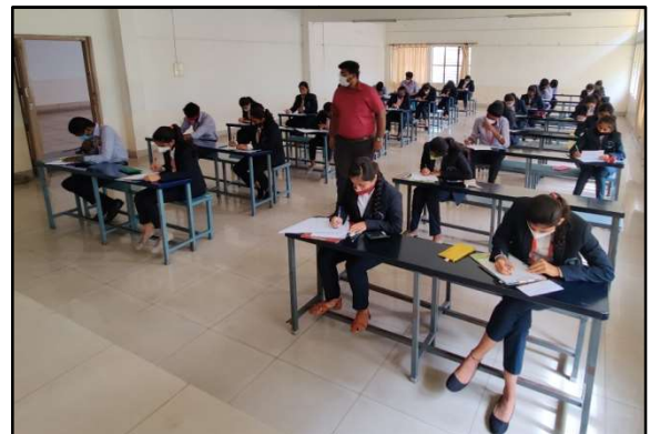
Students appearing for C1 and C2 tests