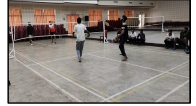
Shuttle Badminton Competition

Throw Ball and Volley ball competitions were held in GSSS SSFGC campus whereas Shuttle Badminton competition was held in GSSSIETW campus.