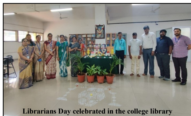
Librarians Day celebrated in the college library