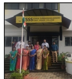
All staff of the college present on the occasion